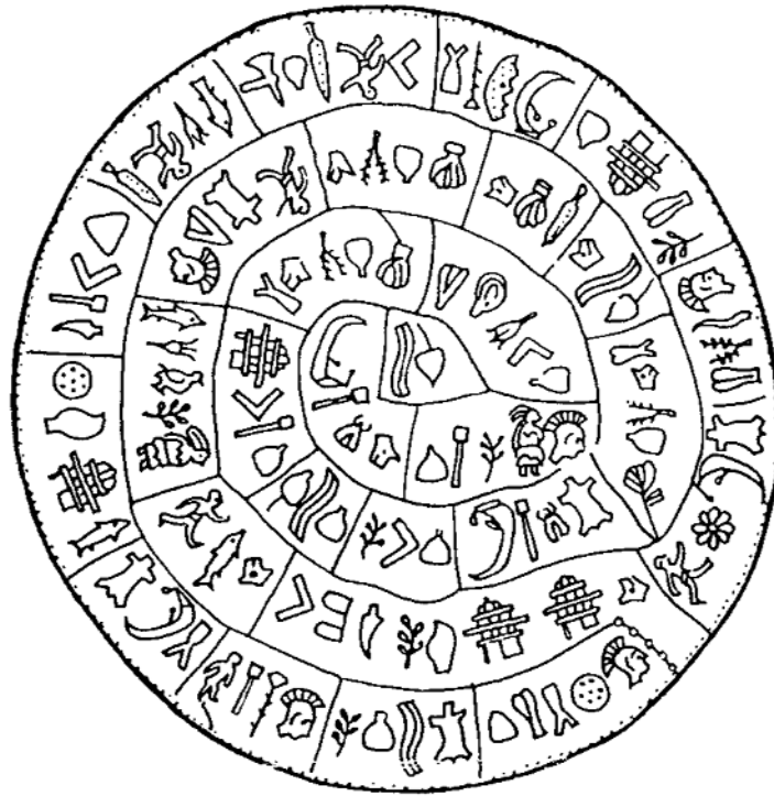
The Disk of Aiglos